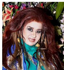
By: Shahnaz Husain

Red in the face? You're not alone. Flushed cheeks and pink patches are an extremely common skin complaint—even more so in this season, and increasingly in the era of mask-wearing.