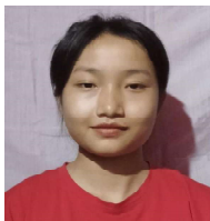
By: Joshila Takhellambam

Firstly, I would like to ask a simple question to all the readers: "What is the life of a woman?" I think that everyone might know some basic answers just by observing some basic importance. But today, I would like to throw Himalayan lights on what it is like to be in the life of a woman. It's not only because I am a woman, but it's the only thing that I was very fond of in the life of every single woman in this vast world. Many of you might question why only women but not men. It's because I never ever wanted to be on the side of the culture that I was born into, i.e. women should be compulsorily married. Or in a lighter way, unmarried women are not taken very seriously.